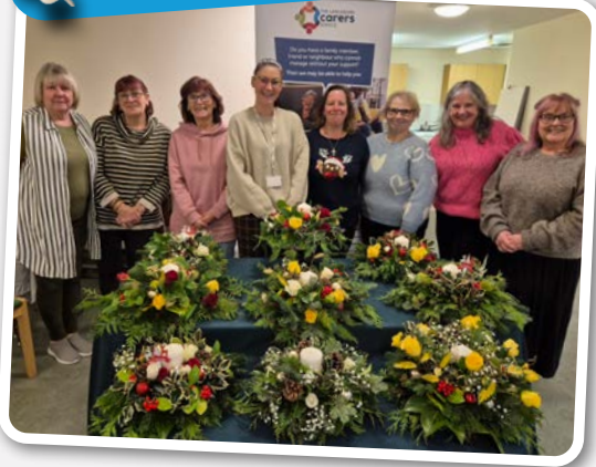
Festive Flower Arranging "I've had a fabulous time away from the hustle and bustle of my caring role, how very relaxing"