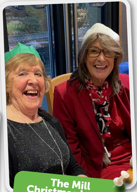
The Mill Christmas Lunch "It was my first activity since I've been caring for my mum. It's wonderful when we go to activities and we are the ones being looked after."