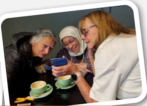
Monthly Coffee & Chats 'The group provides me with a safe space, occasional tears and lots of laughter'